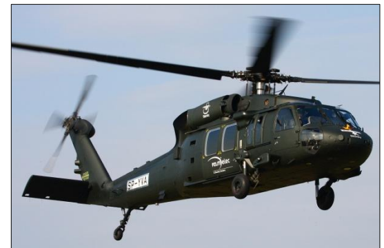
Brunei orders S-70i™ BLACK HAWK helicopters