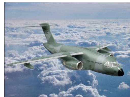
HS selected for the electric power generation system and the auxiliary power unit on the Embraer KC390

Industrial orders up 16% at constant currency