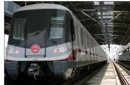
UTC Fire & Security won a contract to design and install fire and alarm products at Subway Line 11 in Shanghai